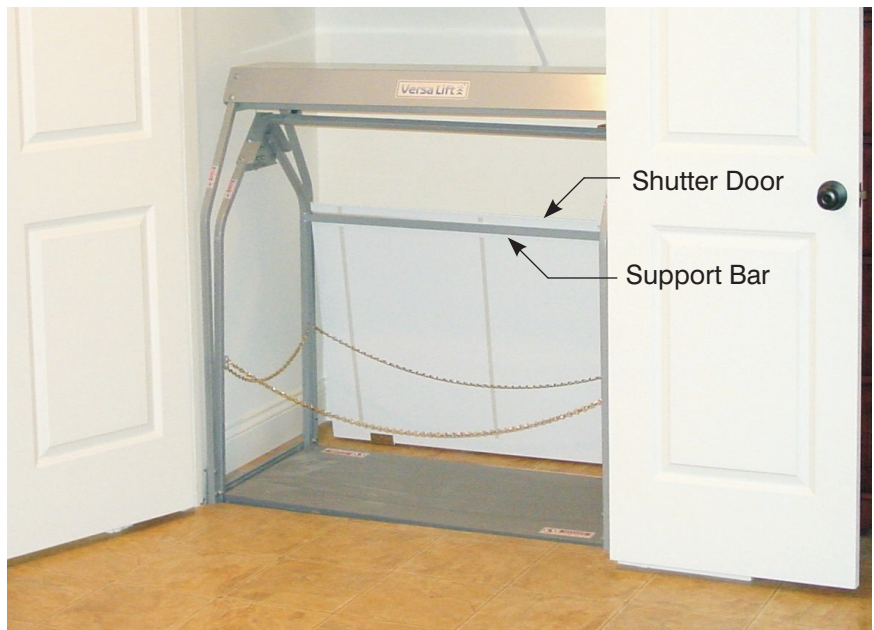
Fig.1: When the lift platform is up, the shutter door rests on a support bar.

The AS24 Auto-Shutter accessory includes all parts and hardware needed for installation, along with illustrated detailed instructions.