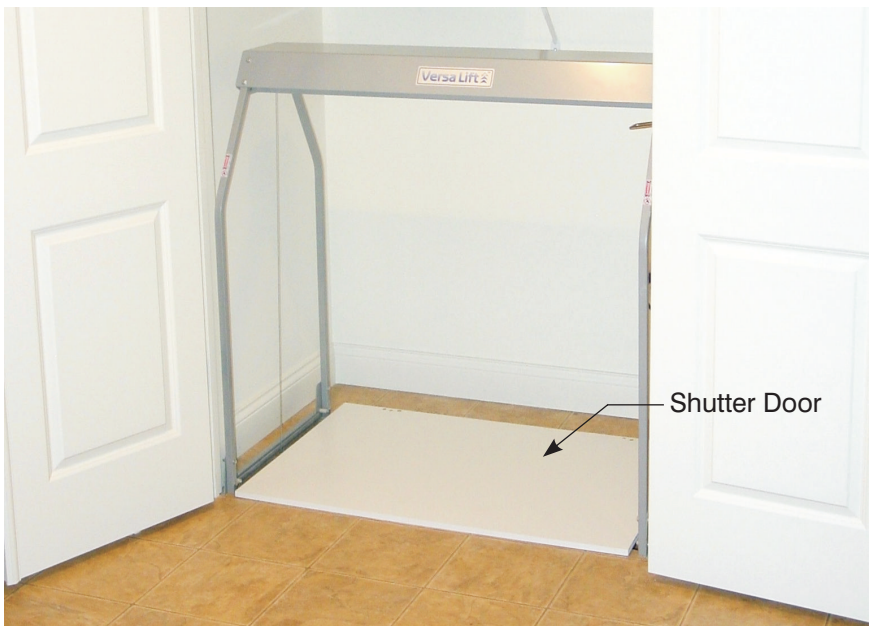
Fig. 3: When the lift platform is down, the shutter door rests on the floor.